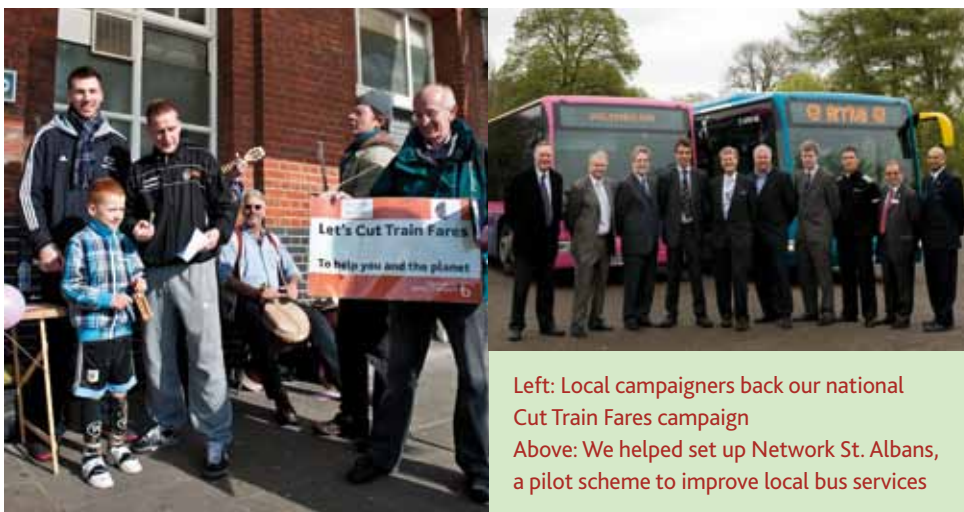
Left: Local campaigners back our national Cut Train Fares campaign Above: We helped set up Network St. Albans, a pilot scheme to improve local bus services