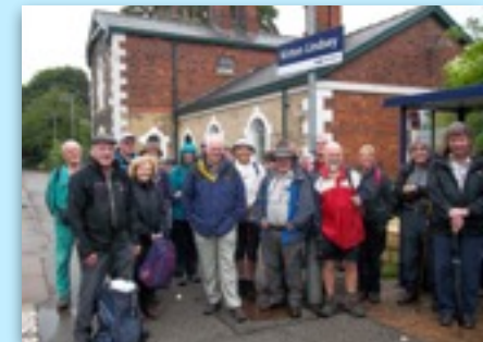
Ramblers at Kirton in Lindsey

Once the capital of the Kingdom of Lindsey, this small town retains its market place, town hall and inns. The Mount Pleasant Windmill still grinds locally grown wheat into flour and bakes a variety of delicious breads. Kirton in Lindsey station is a popular starting and finishing point for local walks upon a ridge revealing a kaleidoscope of views.