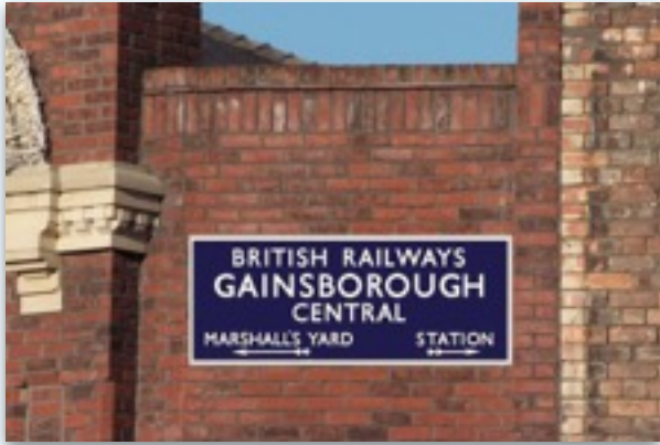
Gainsborough Central station is next to Marshall's Yard shopping experience

The three Lincolnshire towns on the Brigg Line compliment each other.