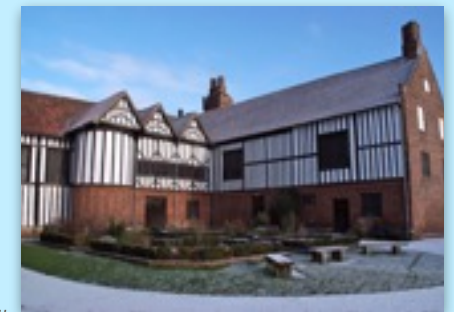
Gainsborough Old Hall

Once a busy inland port on the River Trent, the Riverside Walk connects the 1791 bridge with a town centre that abounds with history. The Old Hall, a 15 th century manor house associated with the Pilgrim Fathers, the Heritage Centre in the old post office, and the ghostly presence to be found in the Old Nick, are just some of the town's attractions.